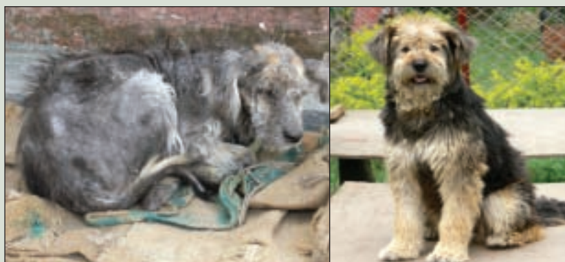
A new dog: Lucy suffered from head-to-tail mange before she was treated at the KAT Centre.