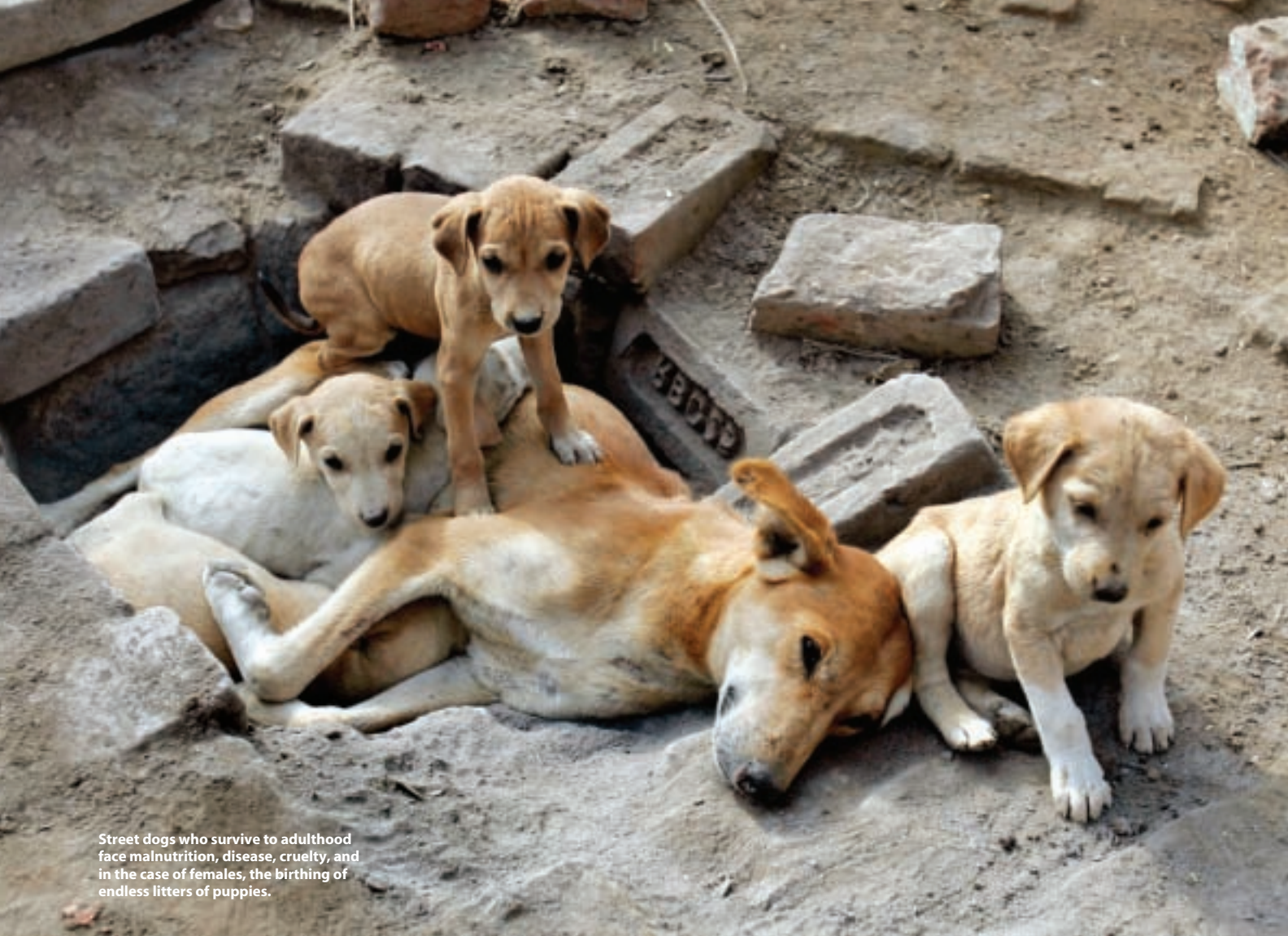
Street dogs who survive to adulthood face malnutrition, disease, cruelty, and in the case of females, the birthing of endless litters of puppies.

Emaciated dogs sleeping on rubbish piles, injured dogs limping across market squares, and dogs so afflicted with mange they're basically scratching themselves to death—these are commonplace sights in India's Ahmedabad, where Sehgal has lived for nearly two decades.