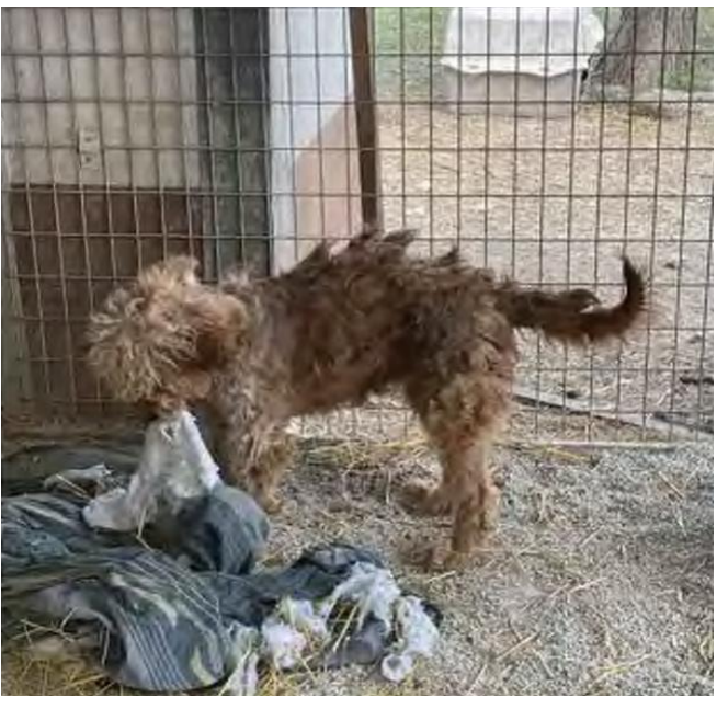
A dog at Ratepa Kennels in Missouri.

The public can do its part to stop supporting puppy mills like the ones in this report by choosing adoption first when getting a pet, or by getting pets only from carefully screened breeders they meet in person at the location where the pets were raised.