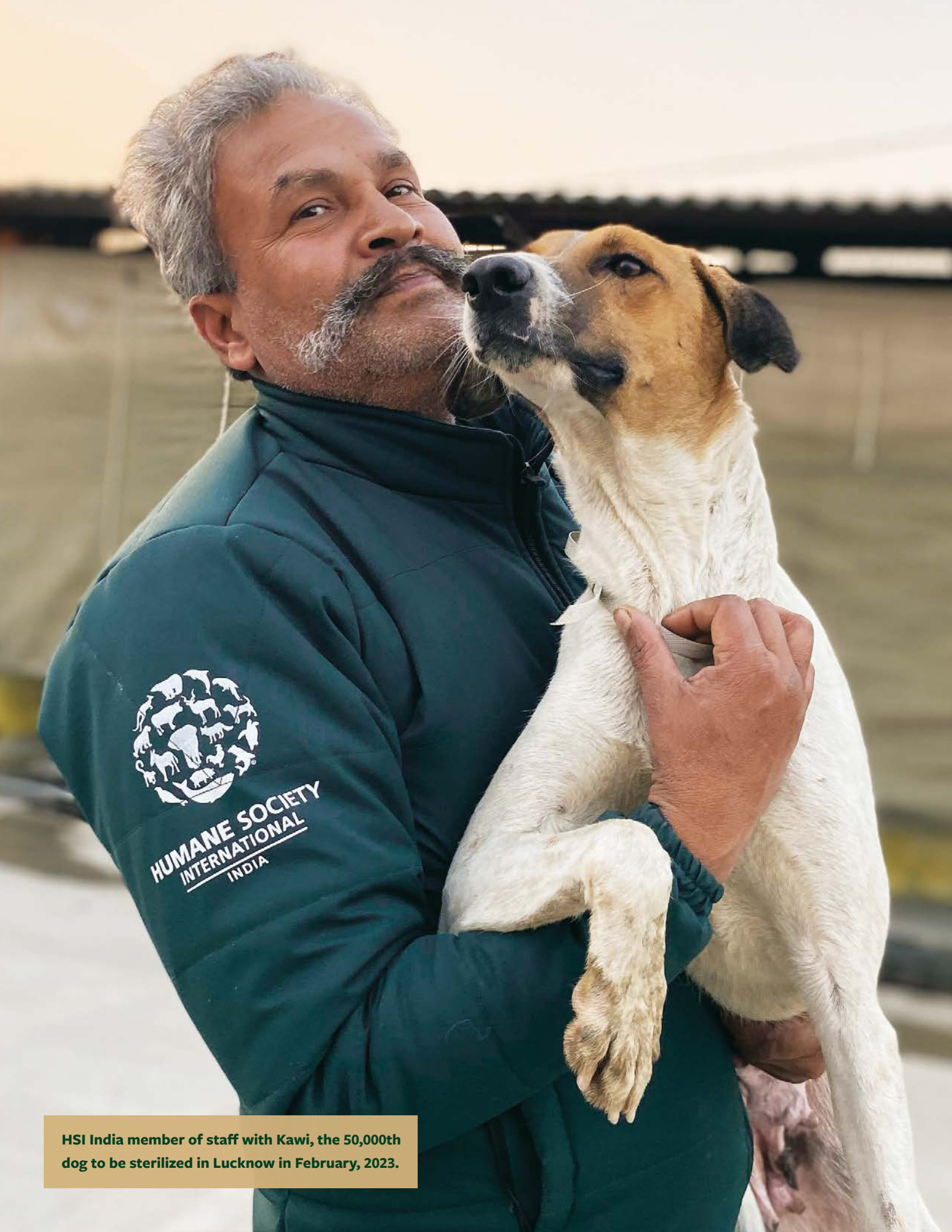
HSI India member of staff with Kawi, the 50,000th dog to be sterilized in Lucknow in February, 2023.