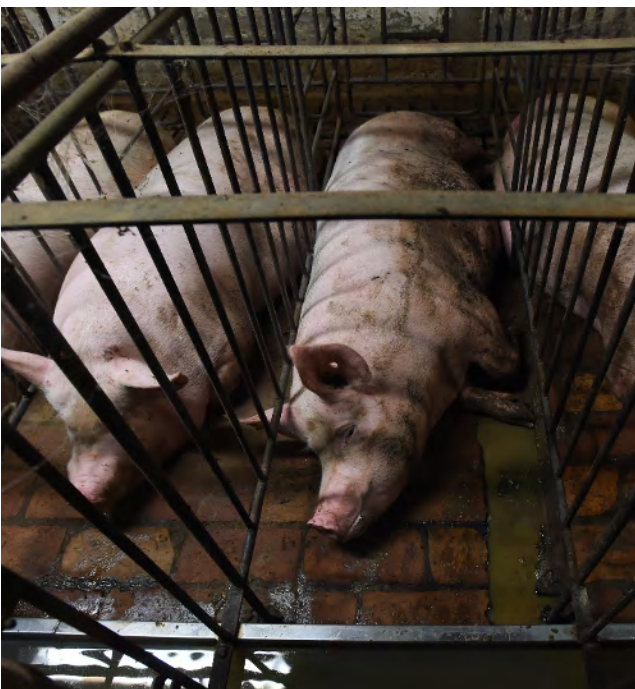
Gestation crates for mother pigs