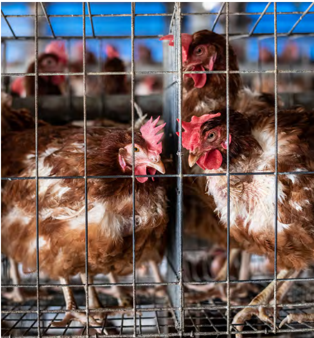
Battery cages for egg-laying hens