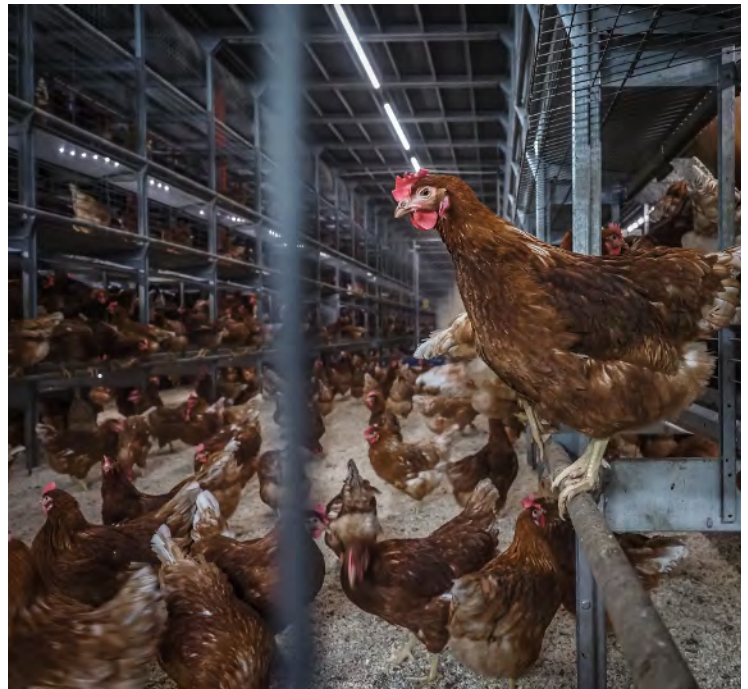
Cage-free aviary - an alternative to cages