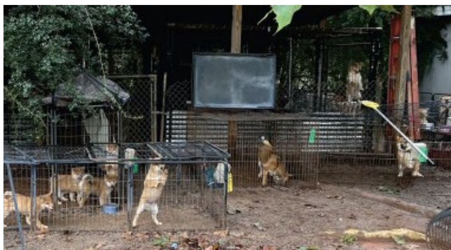
Dogs at an AKC Breeder of Merit's property, Showboat Kennels, appeared to be kept in poor conditions. / GA Dept of Ag., 2025.

Georgia state inspectors documented concerns after finding more than 220 dogs during several visits to Showboat Kennels in 2025. As of December 2025, inspectors observed that the facility continued “to maintain a large number of dogs while attempting to rehome older dogs that are no longer breeding ...” The inspector noted, “Today, there were approximately 223 dogs onsite.” Prior to the December visit, state officials at the property in September counted 228 dogs onsite, not including four litters of puppies, and notified the breeder of concerns related to the structures the dogs were housed in, and a Plan of Action that had not been completed. Photos taken by state authorities showed a variety of visible issues not specifically outlined in the report, including some dogs housed in enclosures with peeling paint, rust, dirt, and ramshackle conditions. The breeders advertise AKC Shiba Inus, AKC bolonkas (a newly recognized breed), and others on Facebook and their website . GA #36104122.