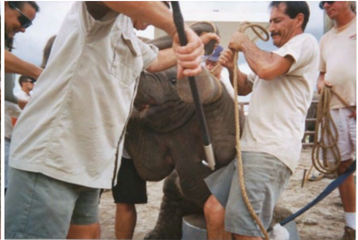
Trainers condition elephants to fear the bullhook at a very young age.

A bullhook resembles a fireplace poker and consists of a long rod, sharp metal hook and spiked tip, and is used as a weapon to inflict pain and suffering on elephants. Trainers use the hooked and pointed end to strike, jab, pull, prod and hook sensitive spots on the elephant's body, such as behind their ears, and on their feet and trunks. The use of bullhooks results in trauma and physical injury, often including lacerations, puncture wounds and abscesses. This barbaric device is used by all circuses that use elephants.