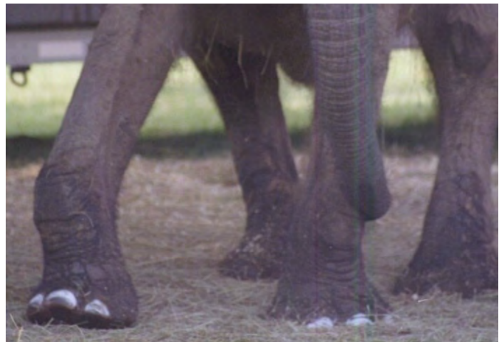
This wild-caught African elephant was hauled around the country for years by a traveling zoo that performed at fairs and festivals, despite suffering from angular limb deformities in three legs, degenerative joint disease and periodic lameness. She was eventually euthanized when she was only 19 years old, far short of an elephant's average lifespan.

Licensees are typically inspected once a year, although they may be inspected more frequently if there are chronic problems or complaints. Catching the most egregious abuse is rare since behind-the-scenes training sessions are completely unmonitored by authorities.